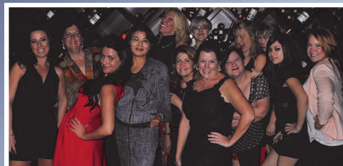
The Salon Savoy Team

Salon Savoy is located at 2727 NW 43rd Street in Gainesville and open Tue -Fri. 9a.m to 8 p.m., and Saturday 9a.m. -6p.m. For more info on Salon Savoy and its list of services, please visit www.salonsavoy.com or call (352) 373-5055 to book your appointment today!