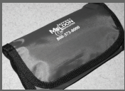
Accident Kit with Camera

Most people think it will never happen to them. However, statistics show that one in five drivers will be involved in a traffic accident this year. How can you protect yourself? Always buckle-up yourself and all your passengers properly; don't drive under the influence; don't drive distracted; and make sure your vehicle is properly maintained. However, sometimes accidents still occur. We recommend you: