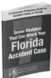
Consumer Protection Accident Guide Book

You will be prepared if you have your Accident Kit with Camera and your Consumer Protection Accident Guide Book! Order yours today! It's Free!