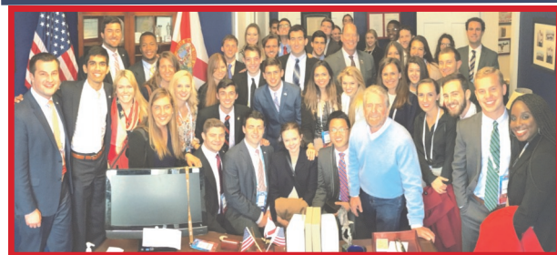
The Gators for Israel student delegation to the AIPAC policy conference at the office of Ted Yoho asking for his support of Israel.