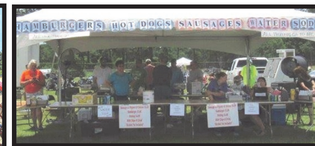
ARC set up a food tent where all proceeds went to The ARC of Marion.