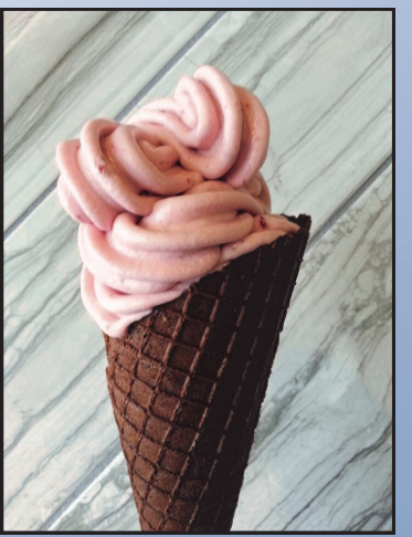
Strawberry Chocolate Cone

For the latest on The Hollow, follow them at thehollowcoffee.com and on Facebook and Instagram at thehollowcoffee.