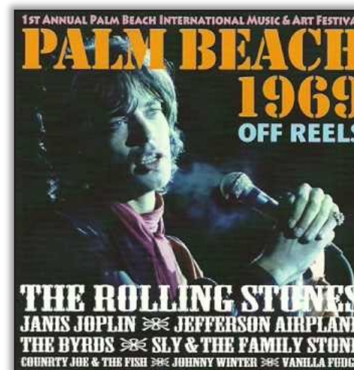
Poster for the 1969 Palm Beach Music Festival

Who would have ever thought that Rock 'n Roll bands would be at the height of their drawing power when all the band members were in their 70's. We all thought Roll 'n Roll was for only for those in their 20's or maybe 30's but after that our favorite artists would have to fade away into oblivion. Not true! And here was the perfect example of the group that stayed the biggest for the longest and proved us all wrong...."Hail Hail Rock 'n Roll" and to my favorite group of all time: The Rolling Stones .