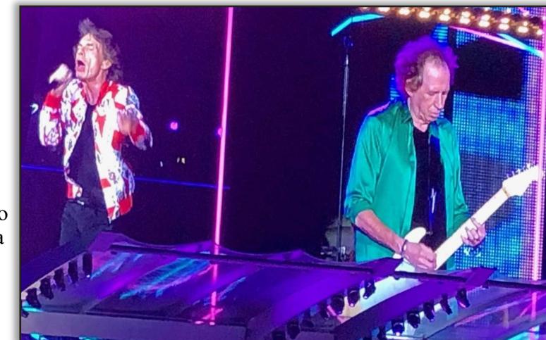
Mick Jagger and Keith Richards rocking out on stage

My next live encounter with the Rolling Stones was on November 27, 1994 at Florida Field in Gainesville. This was the second biggest tour of their careers supporting the "Voodoo Lounge" album. The giant scorpion tail on stage, the towering blow-up characters, and the incredible lights and sound highlighted an over-the-top, 3-hour performance that rocked Gainesville. We somehow worked our way up to the front center of the stage and viewed the show only a few feet away from Mick and the Gang. An epic evening was had by all.