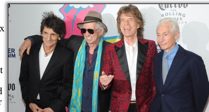
The band all together even after all these years.

I had the pleasure to see the Rolling Stones on July 19, 2019 at the TIAA stadium in Jax with 60,000 other admiring fans. The Stones executed a flawless, 2-hour performance which included a spectacular set list of songs taking me through over 54 years of being a diehard Rolling Stones fan. I remember with vivid clarity sitting by the juke box at my favorite TGIF watering hole, The Ohio Stater, at The Ohio State University in 1965 when the group released its worldwide hit "I Can't Get No Satisfaction." We played that song over and over and over until we couldn't stand up any more to put our dime in the slot. I had heard their albums prior to the release of that song on January 9, 1965 but that was the one that made me a fan for life.