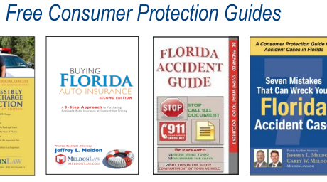
February 2019 Issue

Entering its 16th consecutive year on air, Law Talk LIVE serves as the longest running