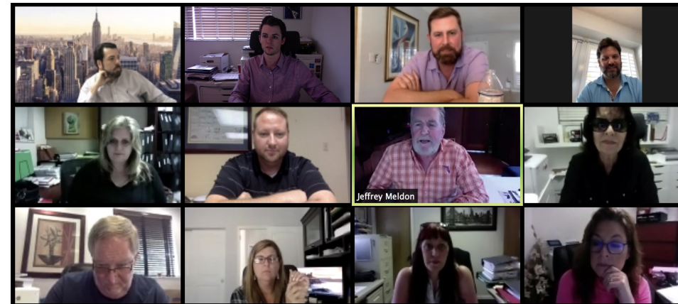
Meldon Law Remote Staff Meeting

Meldon Law has also created a WEBSITE RESOURCE CENTER to help our friends find out what agencies are providing help to those in need. Just go to MeldonLaw.com/Covid19 to access this ever-expanding resource of contact information. We are dedicated to helping our friends and family (that includes everyone reading this newsletter) get through the challenges imposed in response to the Corona Virus Outbreak. If anyone needs any help on anything going on in your life our team of attorneys and staff are standing by to assist you in anyway possible. Just call us at 1 (800) 373-8000 or go to MeldonLaw.com . Meldon Law is dedicated to being part of the solution.