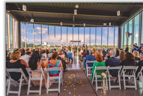
The ceremony being performed in the gorgeous Cade Museum