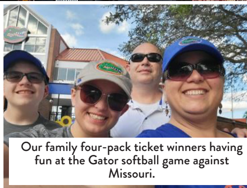
Our family four-pack ticket winners having fun at the Gator softball game against Missouri.