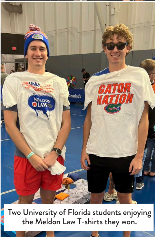
Two University of Florida students enjoying the Meldon Law T-shirts they won.