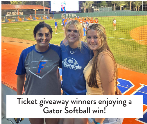
Ticket giveaway winners enjoying a Gator Softball win!