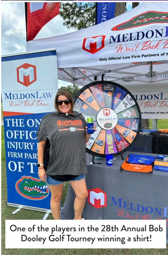
One of the players in the 28th Annual Bob Dooley Golf Tourney winning a shirt!