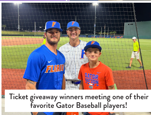
Ticket giveaway winners meeting one of their favorite Gator Baseball players!