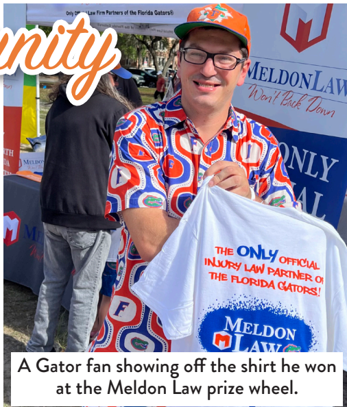
A Gator fan showing off the shirt he won at the Meldon Law prize wheel.