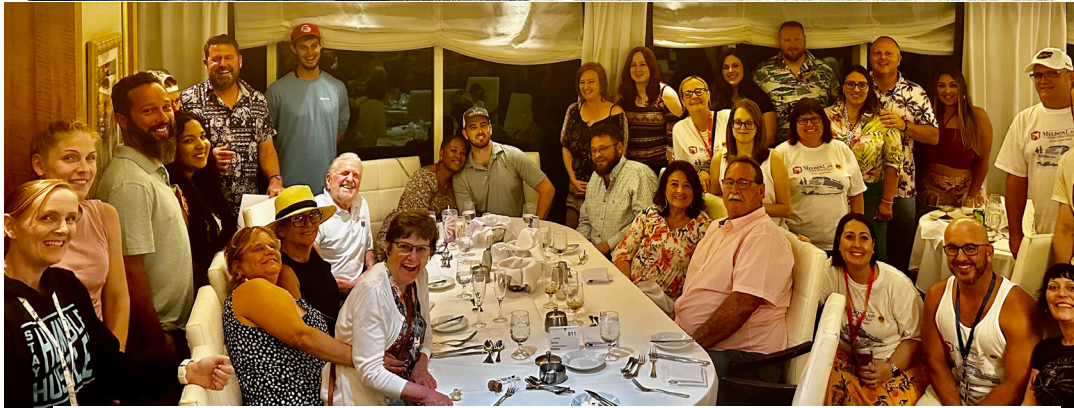
The Meldon Law team on the Independence of the Seas enjoying dinner together.