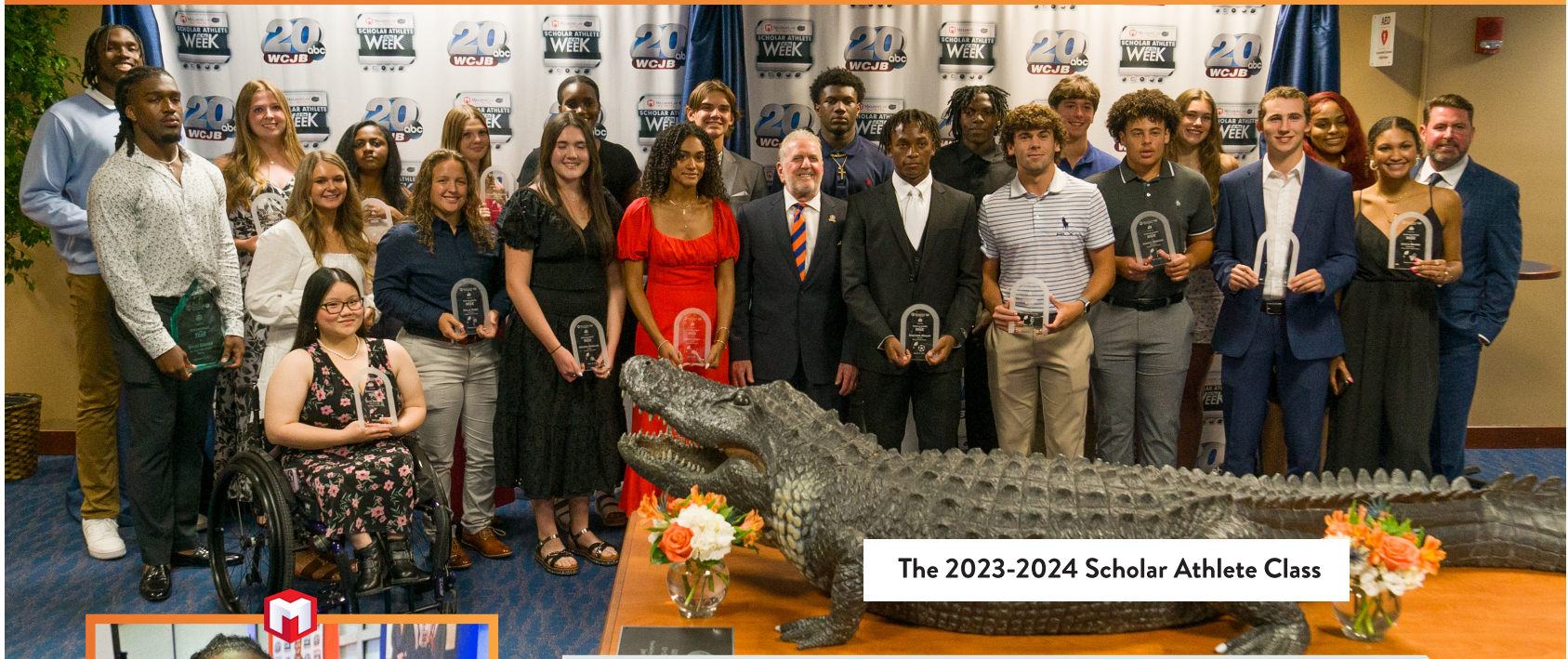
The 2023-2024 Scholar Athlete Class

Phone: (352) 373-8000 | www.meldonlaw.com | Help@meldonlaw.com | Contact us 24/7 for a Free Consultation—We Deliver Because We Won't Back Down