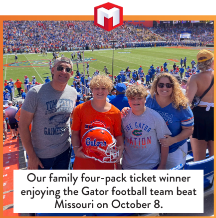
Our family four-pack ticket winner enjoying the Gator football team beat Missouri on October 8.