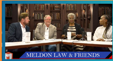
Follow our Podcast