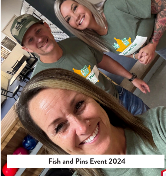
Fish and Pins Event 2024