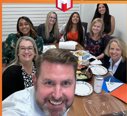
Enjoying a team lunch at our Ocala office