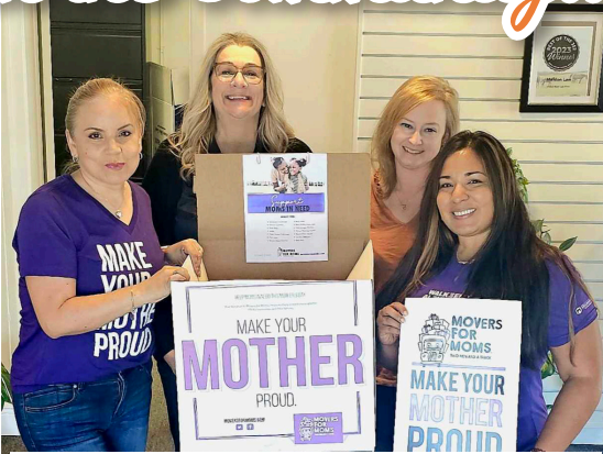
Another year of supporting the Movers for Moms campaign