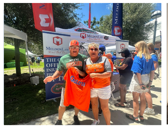
Winners of the social media giveaway.