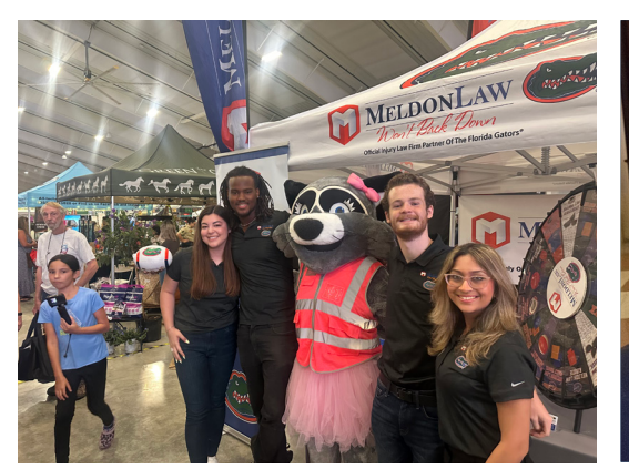
Meldon Law team at the North Central Florida Outdoor Expo at the World Equestrian Center.