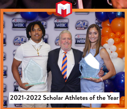
2021-2022 Scholar Athletes of the Year

us at (352)-373-8000. If you know of any former scholar athletes, please let us know how to contact them so they can be included. We are interested in getting bio's on what everyone is doing and what becoming a Scholar Athlete meant to them. Stay tuned to more announcements regarding key note speakers and former Scholar Athlete who will be attending.