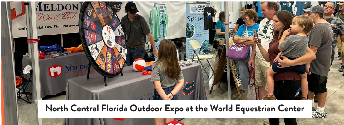
North Central Florida Outdoor Expo at the World Equestrian Center