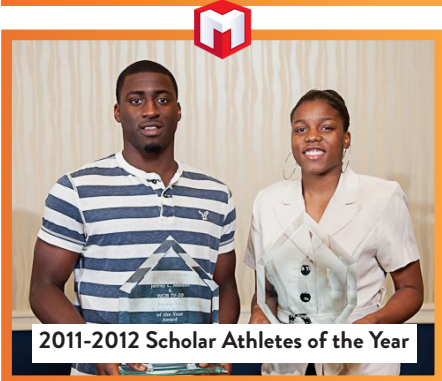
2011-2012 Scholar Athletes of the Year