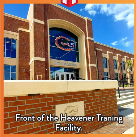
Front of the Heavener Training Facility.