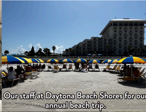
Our staff at Daytona Beach Shores for our annual beach trip.