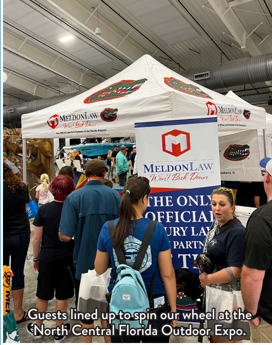
Guests lined up to spin our wheel at the North Central Florida Outdoor Expo.